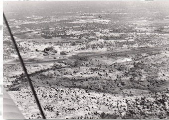
Aerial View Of Cresco Fertiliser Plant, Guildford Road And Ashfield Before Development, C.1935