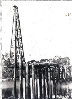
Guildford Road Bridge Under Construction, 1936