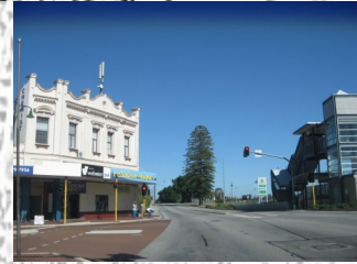
Guildford Road, Bassendean, 2010

Originally the main highway (before 1842) from Perth to Guildford. The Guildford township was named for James Stirling's wife, Ellen Mangles, who was from Guildford, England, and the place where they were married.