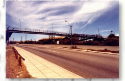
Railway Bridge over Guildford Road : Looking West Toward Railway Station, C.1975