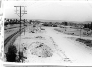
Diversion of Guildford Road between Kenny and Brook Street : looking east and showing the new Wilson Street junction C. 1977