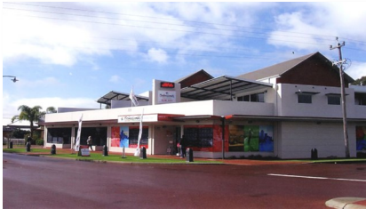
Town of Bassendean Built Form and Character Study Stephen Carrick Architects May 2018 pp.19-22.