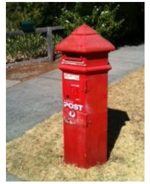
Town Pillar Box.