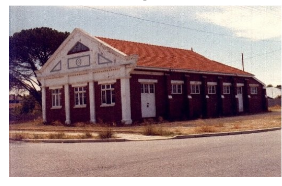
Bassendean Masonic Lodge.