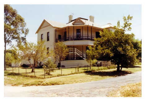
Success Hill Lodge.